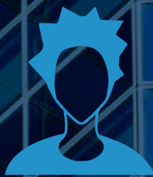
Future of work for today's 15 year old